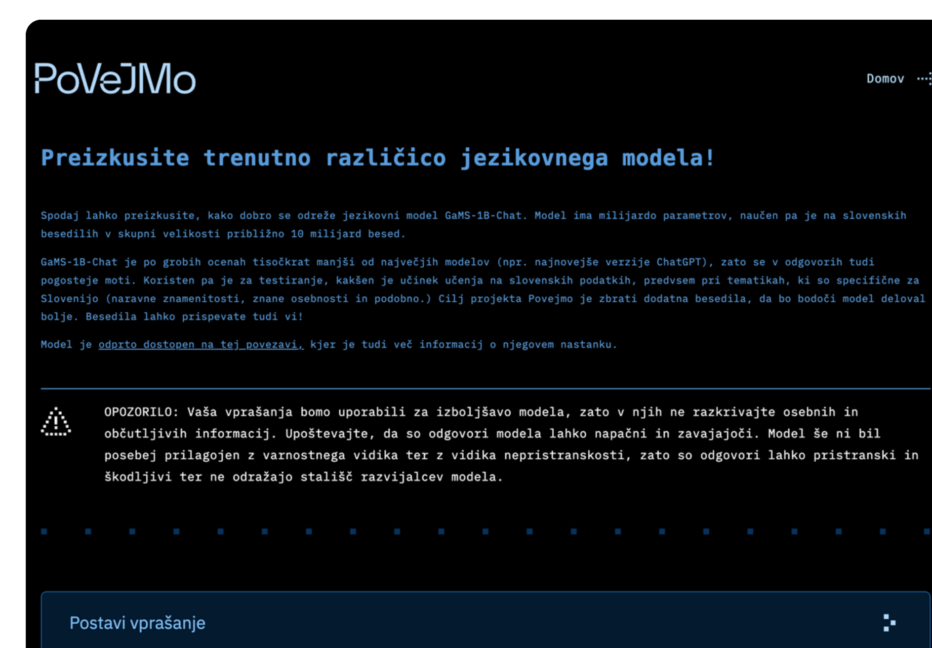
Figure 2: The section of the web portal where the interested participants can test the existing model ( https://povejmo.si/klepet/ ).