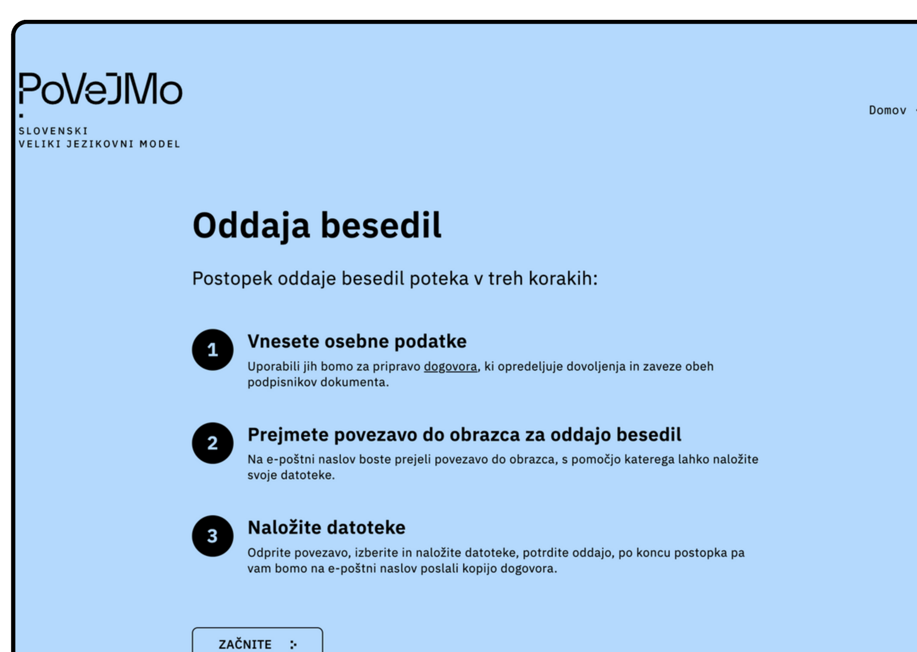
Figure 1: The section of the web portal where the interested participants can provide their texts ( https://zbiranje.povejmo.si/ ).